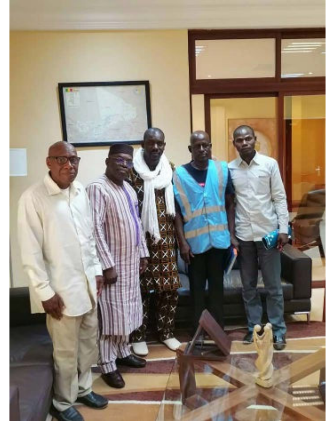
Blue Shield Mali meet the Minister of Crafts, Culture, Hospitality Industry and Tourism.