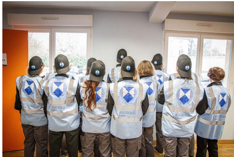
Training deployable Operational Managers to protect heritage in crisis