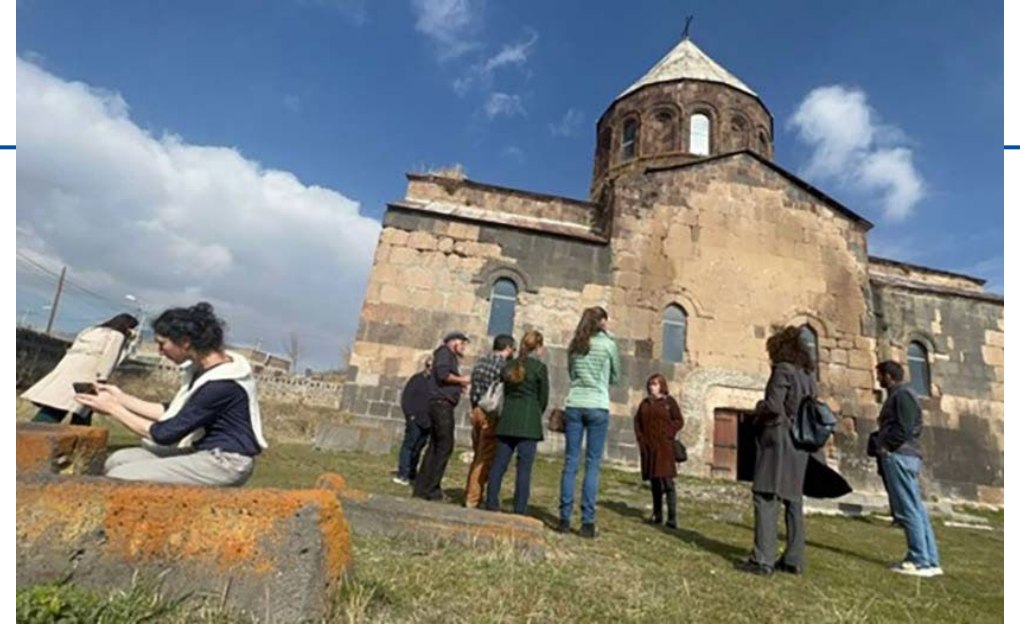
Field day in the Gegharkunik province, Joint International Workshop on Armenian Cultural Heritage © Blue Shield Austria & Blue Shield Armenia (Under Construction).

We are stronger and more successful together.