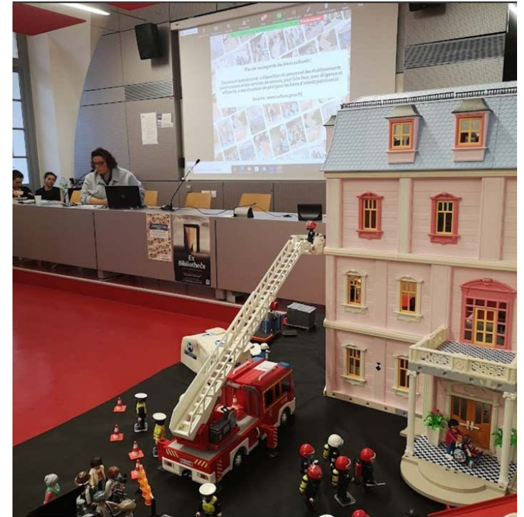
Playmobile evacuation model, 2023 © Blue Shield France.

The number of participants from cultural institutions was disappointingly small, which shows that colleagues from the field of culture are very interested in the aspects of popularizing cultural heritage, but not in elaborating the aspects of cultural heritage protection.