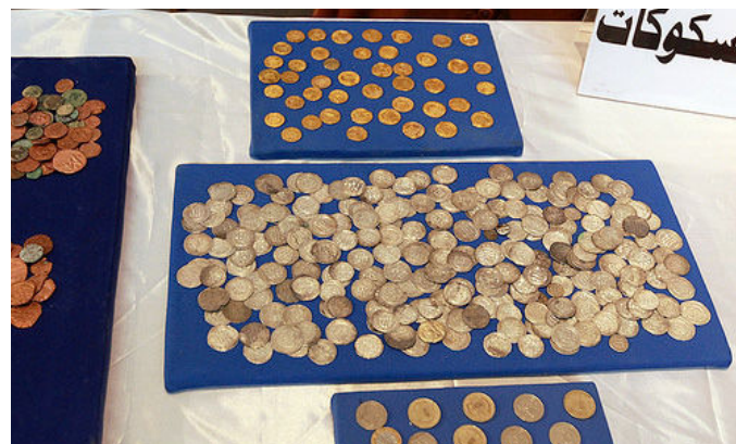
Coins recovered from the raid on IS leader Abu Sayyaf al-Iraqi displayed at the Iraqi National Museum, July 15, 2015.