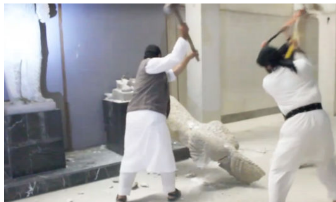
IS militants smashing antiquities at a Mosul museum