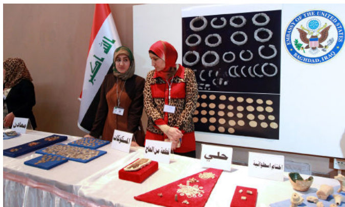
Iraqi women standing next to artifacts displayed during a ceremony at Iraq's National Museum where looted artifacts recovered by the US military during a recent raid in Syria are handed back to the Iraqi authorities, July 15, 2015.

Coins and other metal objects have emerged as particularly attractive items for IS. The organization finds coins advantageous due to their ease of transport and the ability to smuggle them among other objects. Some coins can also only be attributed generally to a period or region, making it possible to more effectively disguise their Syrian or Iraqi origins.