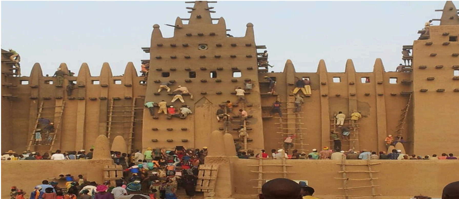
Djingareyber Grand Mosque of Timbuktu, Mali, built between 1325 and 1327