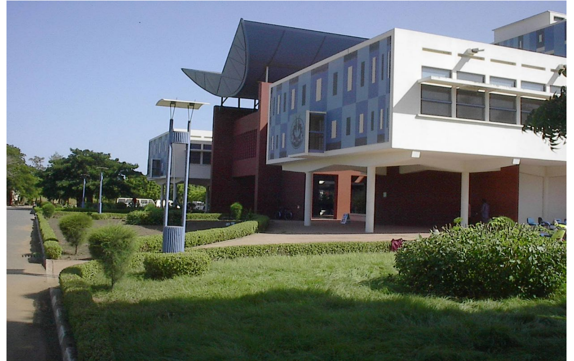
Central Library, University Cheikh Anta Diop of Dakar, Senegal

This political instability (usually during the electoral period) generates riots characterized by acts of vandalism, theft (economic interest), destruction or fire of public buildings symbols of the disputed State as well as their documentary resources (sometimes classified World Heritage or the Memory of the World Register).