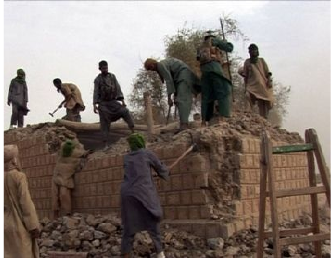
destruction of mausoleum in Timbuktu

Since 2012, taking advantage of weak states and in political-security crisis following the dislocation of Libya, terrorist groups of Salafist jihadist ideology (notably AQMI, MUJAO, ANSAR DINE, BOKO HARAM) place the entire Saharo-Sahelian band from West Africa (Mali, Mauritania, Burkina Faso, Niger, Nigeria) to Lake Chad in a cycle of violence and insecurity from which it is still struggling to escape.