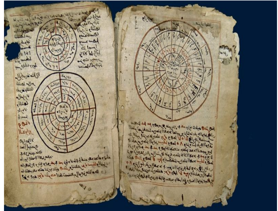
Timbuktu manuscripts dating from the 17th to the 19th century

These armed movements are engaged in a veritable "cultural war" by the destruction of the cultural heritage of West African Islam, which is essentially Sufi: manuscripts, historical and architectural monuments (mausoleums of Timbuktu in Mali and the cultural landscape of Sukur in Nigeria classified as heritage world of humanity) in the areas under their control.