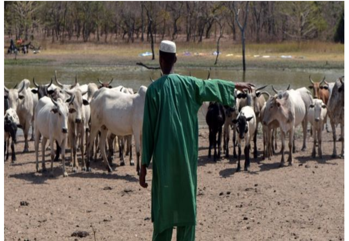
Access to natural resources, sources of inter - community conflict

This new environment of chaos fuels community conflicts. Some ethnic groups blame each other for bias against belligerents (terrorist groups, MINUSMA, national armed forces, G5 Sahel, Barkhane ...) which often causes violent reprisals between communities.