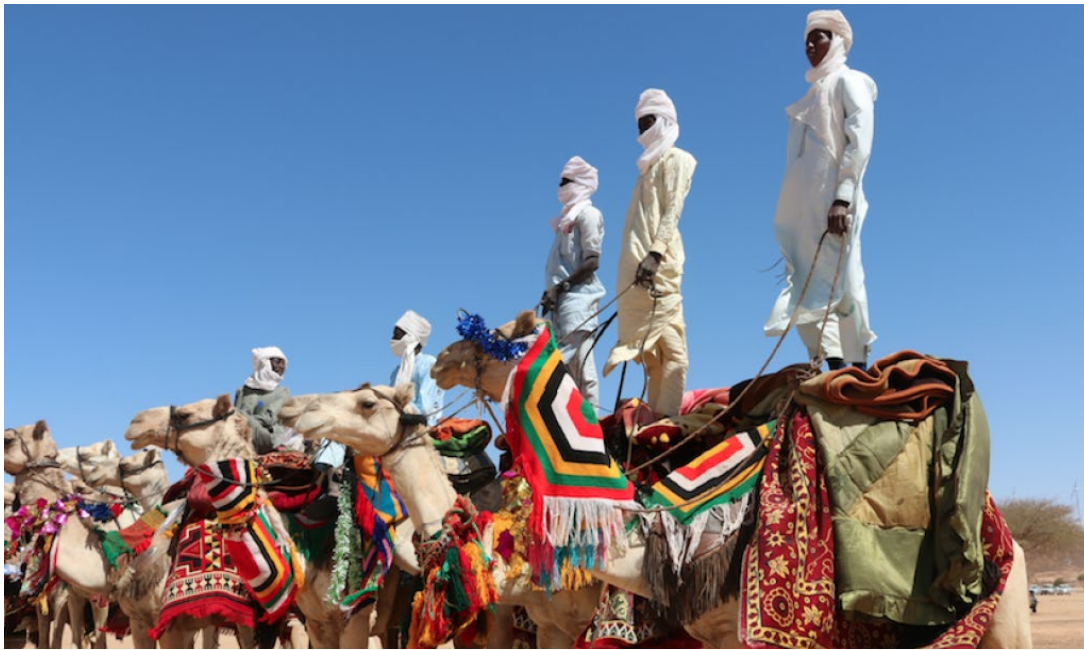
Dance show and camel parades, International festival of saharan cultures, Chad