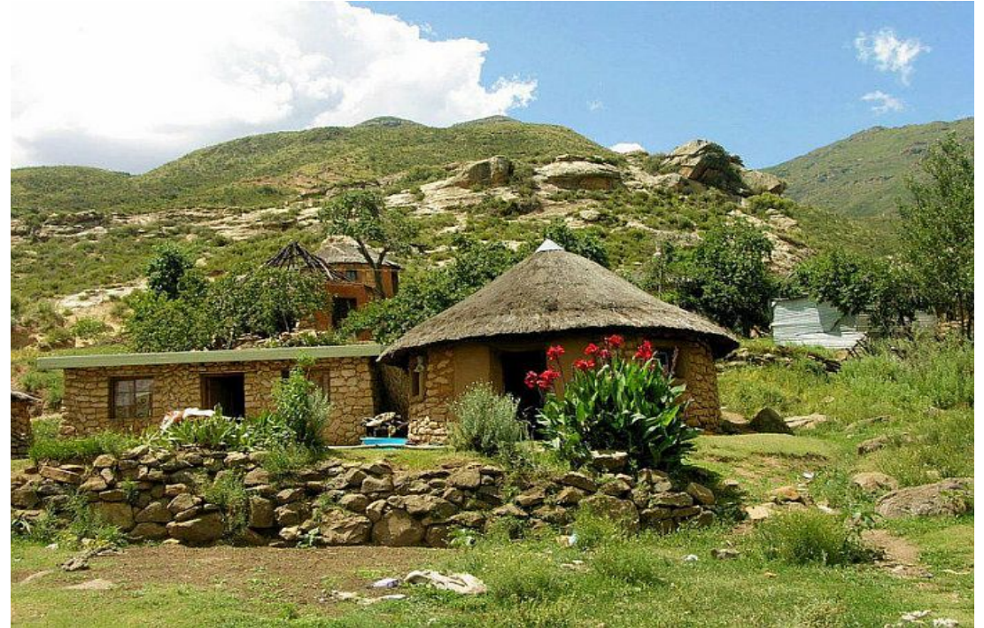
cultural landscape of Sukur, Nigeria