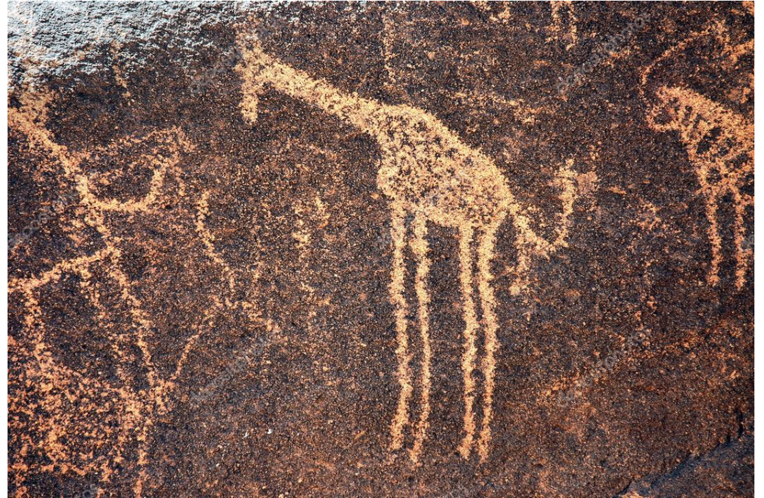
Rock painting, Niger