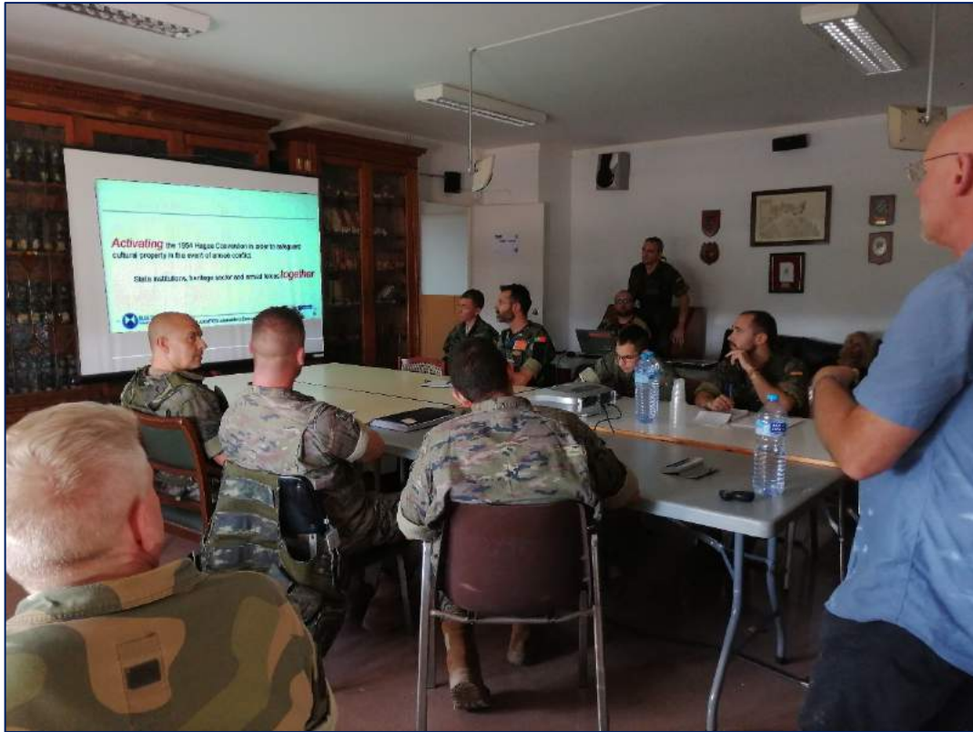
Figure 3: NRDC Spain attends CPP mentoring conducted by BSI