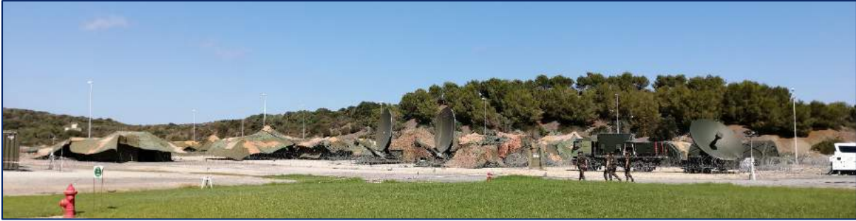
Figure 1: NRDC Spain temporary exercise HQ for Trident Jackal 2019.