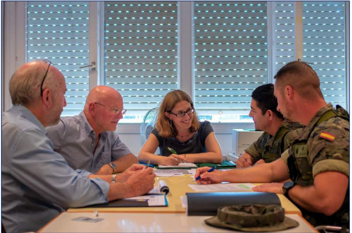
Figure 5: J9 CIMIC staff attend a meeting with representatives of the Host Nation Ministry of Tourism, Culture, Youth and Sport (Culture).