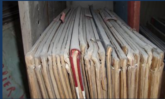
Damaged shelves after the earthquake