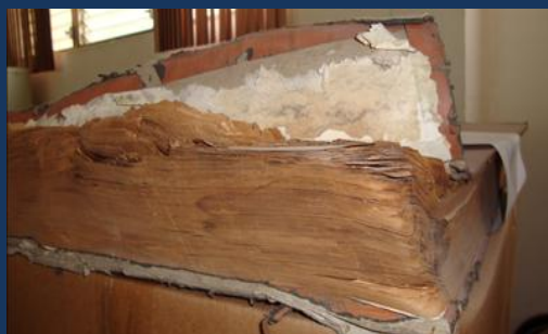
BNH Reading room