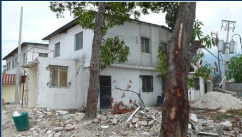
1 – Building where the rescued diplomatic records are stored

During our stay, an important work of rebuilding and classification summary has been initiated. The archives are located on two floors but the climatic conditions on the ground floor as well as water leaks have forced the team of volunteers to move a maximum of collections on the first floor.