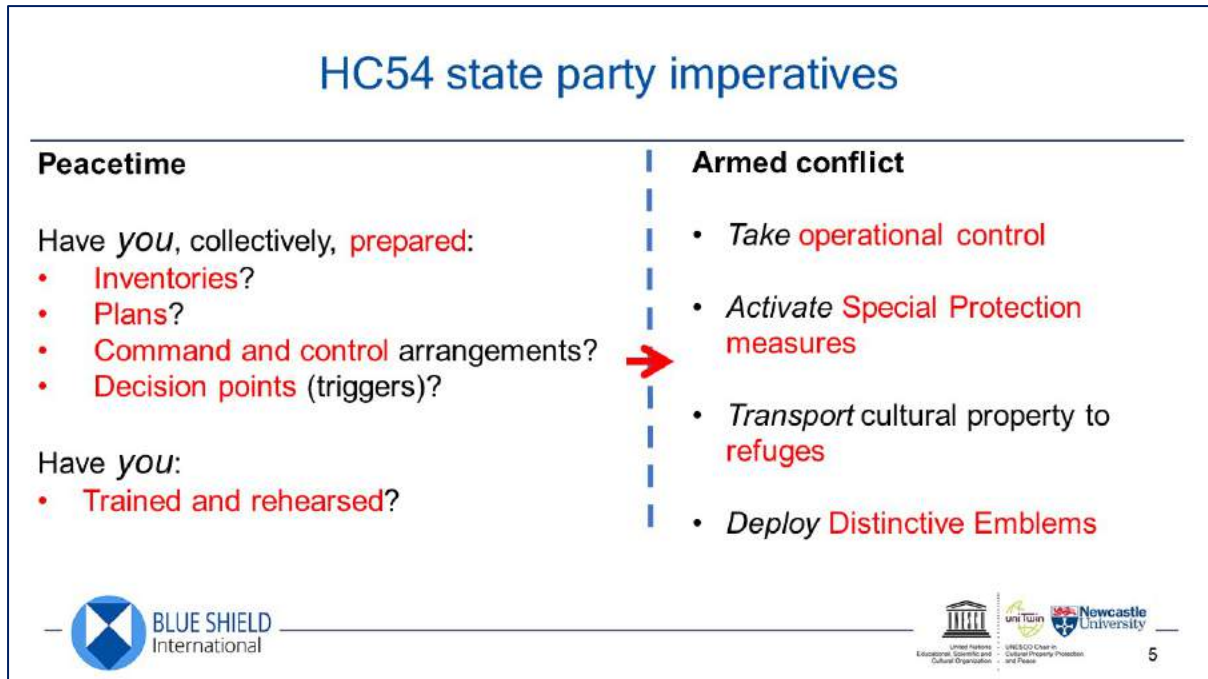
Figure 2: The Executive Pillars of the 1954 Hague Convention