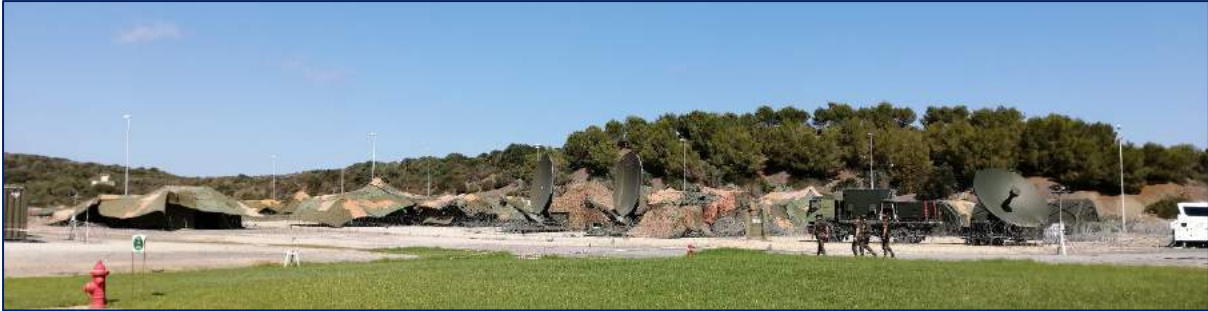
Figure 1: NRDC Spain temporary exercise HQ for Trident Jackal 2019.