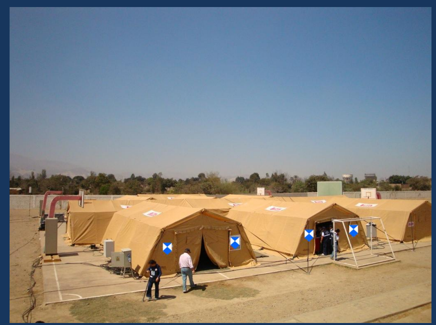
4 - Virtual representation of the center