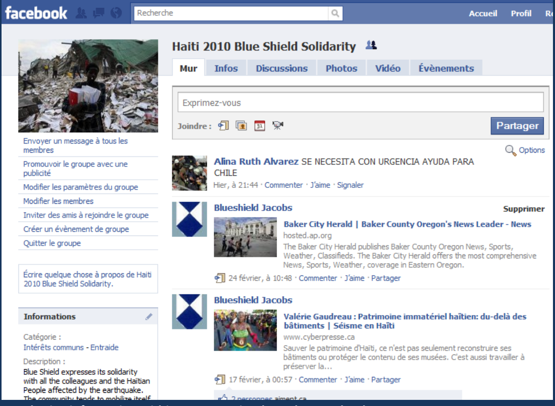
2 - Sharing information within a community through a Facebook Group