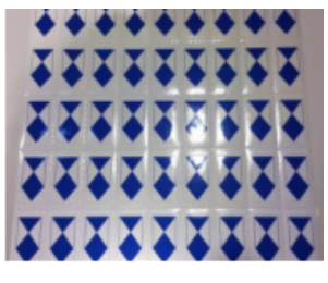
Logos rétro-réfléchissants © Bouclier bleu France

The growth of interest in these retro-reflective logos is a sign of both a clear need for simple and functional identification for firefighters, and the implementation of CBSPs in more and more heritage facilities.