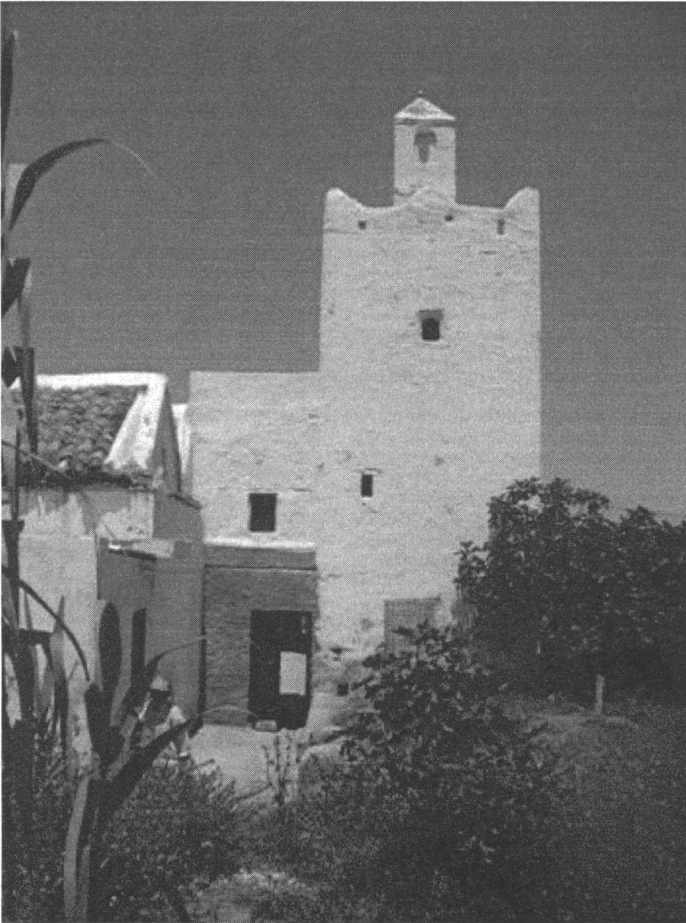
The Mosque of Mestassa, Morocco