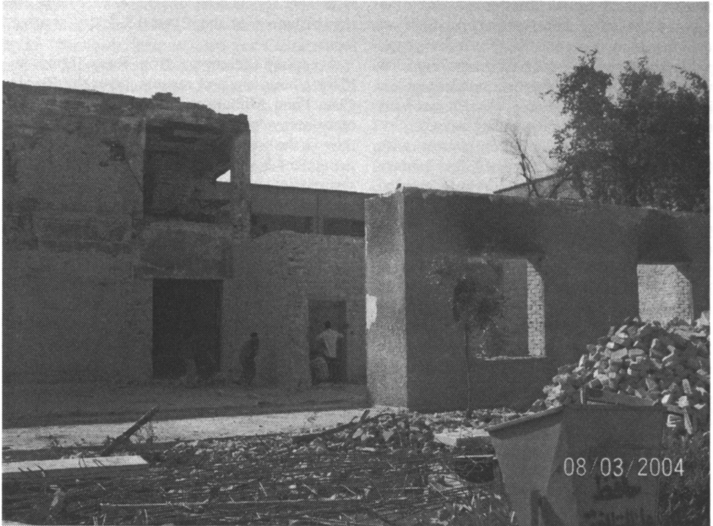
Rebuilding of the Central Library at the Bab al-Muazzam campus of the University of Baghdad