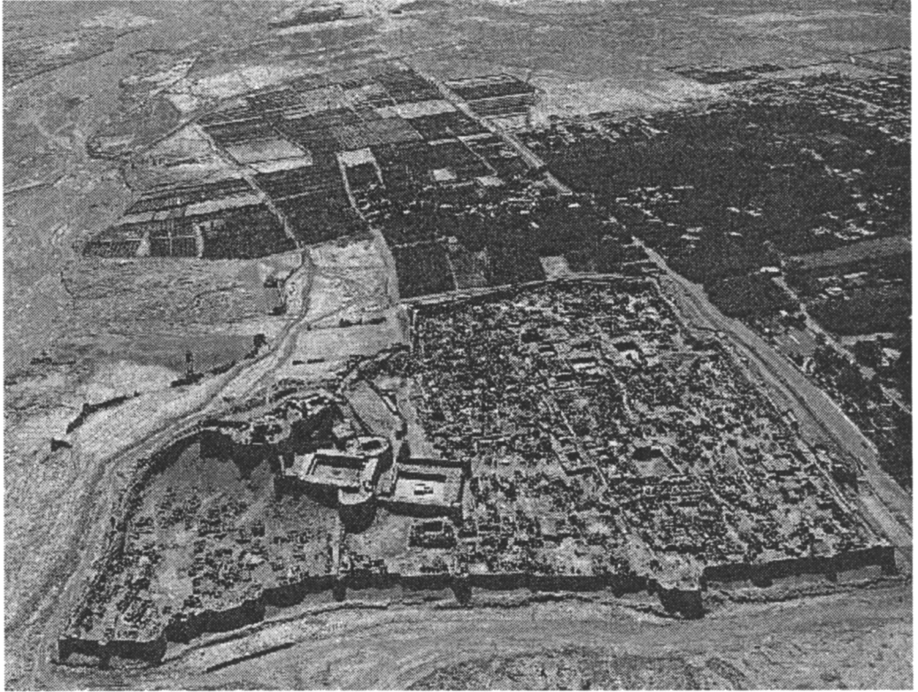
Air photo of the Citadel of Bam and other historic buildings after the earthquake

The mosque of Mestassa in Al Hoceima is a particularly distinctive version of Merinid architecture. It represents, moreover, a source of cultural pride for the future, as well as a centre point for the daily lives of a large group of people. The Amazigh distinctiveness of this and surrounding buildings has attracted many in the past to its ingenious adaptation to the local geography and topography. In addition, other dwellings display a more contemporary feature: 'clever building', by which present-day builders in North Morocco allow many people to 'store' their 'European' money (or foreign remittances from work abroad, especially in Holland), by investing in a house in their own homeland, out of sight.